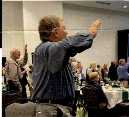
Commissioner Lynn Copeland being sworn in for his term as Commissioner